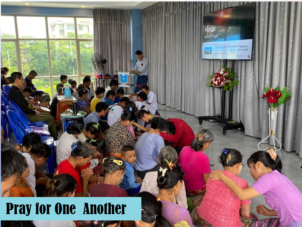
Pray for One Another